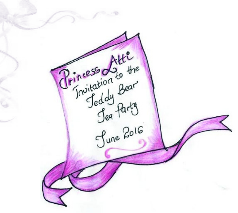
Atti has been looking out of the window everyday looking for her invitation to the Teddy Bear Tea Party.