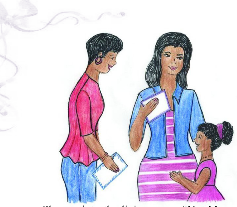
She ran into the living room. "Yes Mommy! Hello, Mrs. Brunch!" Atti's mother was holding an envelope in her hand. Atti couldn't believe her eyes! It was finally here, her INVITATION...addressed to Princess Atti.