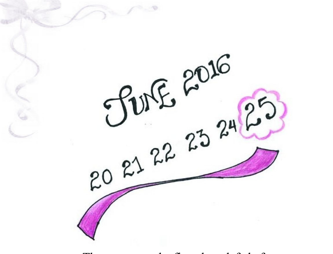
There were only five days left before the big day and Atti still had not received her invitation.